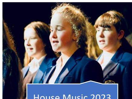
House Music 2023