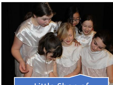
Little Shop of Horrors 2022

The school is a member of the Society of Heads, the Independent Schools Association and the Boarding Schools Association and we expect all staff to look outwards and focus on their continuous professional development.